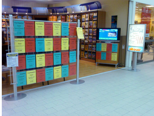
Fig 2. Travel Agency B, an open space off of a well-trafficked grocery store entranceway, featuring colorful photocopied flyers and a large display advertising travel specials

After hour-long observations at both sites, we found that although the displays were similar in content, domain, and intent, there were several marked differences. Because of the nature of the spaces in which they were located, the goals of people in the spaces differed. The people in the viewing area of Travel Agency A were there because they were intentionally seeking travel information; they had made a conscious decision to enter the office and the display was therefore reaching a somewhat targeted audience. In comparison, the display in Travel Agency B was broadcasting information to coincidental passersby- the grocery store customers who were walking by the travel agency on their way out of the store. In both locations, we found that people's glances at the large display were rare and lasted approximately 1-2 seconds. Glances at Travel Agency B were relatively more frequent, with 17 out of 105 people looking towards the display, whereas only three of the approximately 50 people observed in Travel Agency A glanced at the large display. In both cases, people looked at the large display only after first browsing or glancing at brochures and flyers in the area, sometimes for several minutes. In the case of Travel Agency B, the display was angled to face people leaving the store more than to face people entering the store. All glances that we observed were by people on their way out of the store.