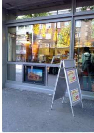
Fig 4. A display located significantly below eye-level unsurprisingly receives almost no glances and is often obscured from sight by passersby.