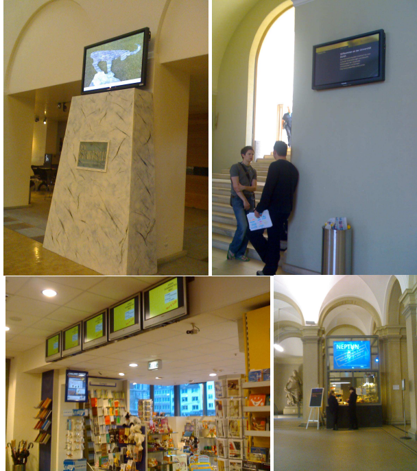
Fig 3. Large displays in positioned well above passersby's heads in a variety of location attract few glances.

Incidentally, we observed only one instance of a large display positioned significantly below eye-level; this display was outside a Middle Eastern restaurant and showed video of the Middle East as well as of Middle Eastern food preparation. This display not only received no glances during our observations, it was often obscured from sight by people in the area (Fig. 4).